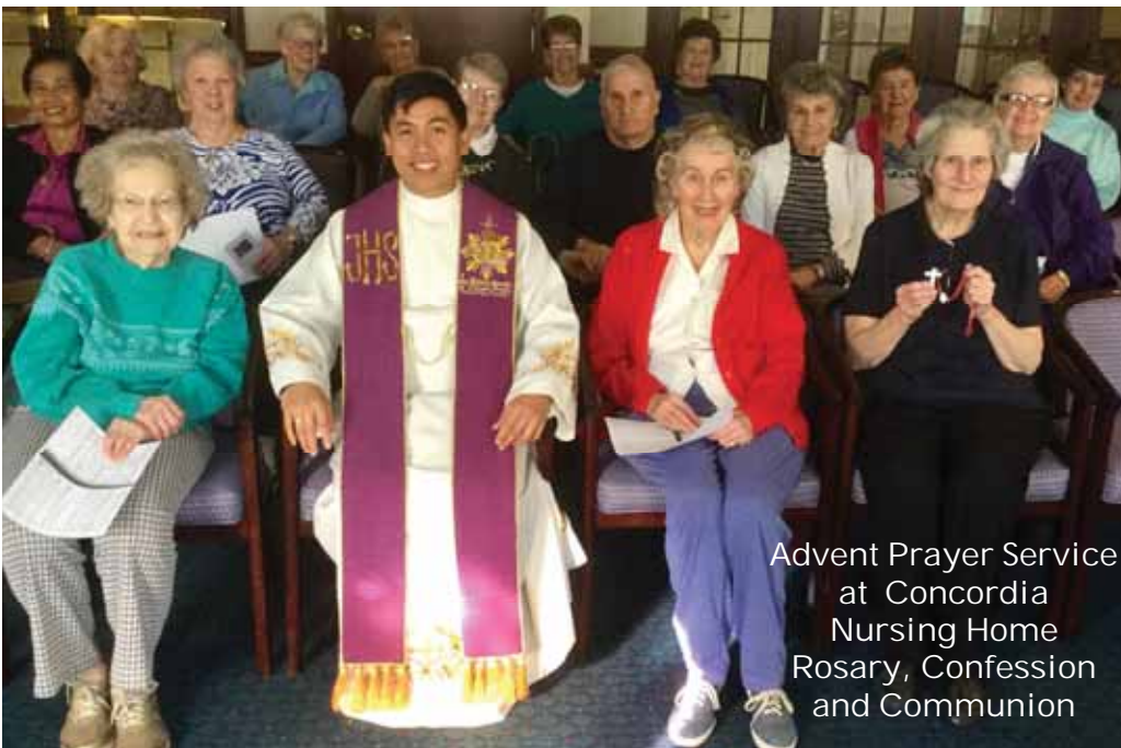
Advent Prayer Service at Concordia Nursing Home Rosary, Confession and Communion